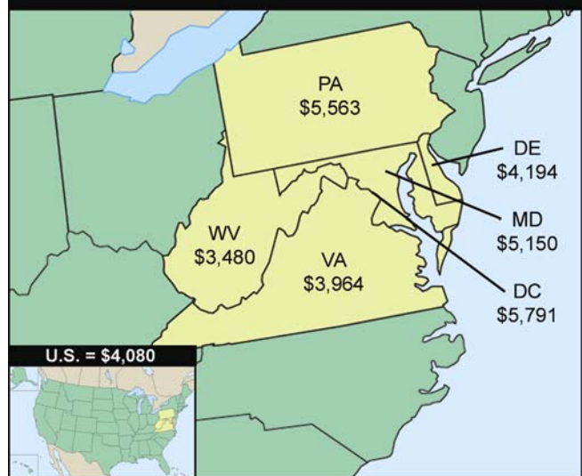
Figure 2: Cost per Teen Birth (17 and under) in Washington, DC Compared to Other States in the Region

Nationally, the overall cost to taxpayers is estimated to be at least $9.1 billion a year. The total costs include those attached to teen mothers, their partners, and children born to teen mothers. The most significant costs are associated with poorer outcomes for the children of teen parents as compared to the outcomes for children born to mothers who are 20-21 years old. Please see figure 1 for detailed information on specific costs.