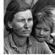
Photo: Migrant mother with California, 1936.