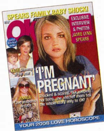
Jamie Lynn Spears, of the wholesome Nickelodeon show "Zoey 101," announcing she's pregnant at 16.